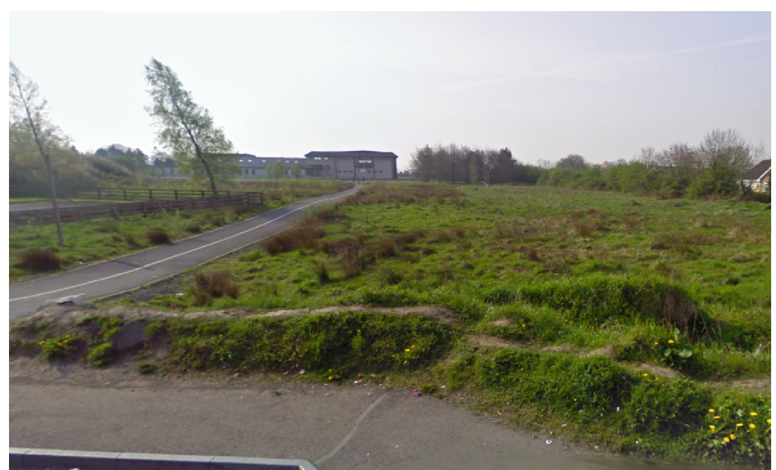
Figure 01: Image of proposed site - St. Farnan's Post Primary School at end of path

The proposed town park will be developed on a one hectare parcel of land on the southern side of the main street (R403). The proposed site is predominantly unused except for a pedestrian path that provides access to Saint Farnan's post primary school. The condition of the site is primarily overgrown with high grass and scrub bushes throughout. The perimeter of the site is lined with hedges, and trees of varying condition and size.