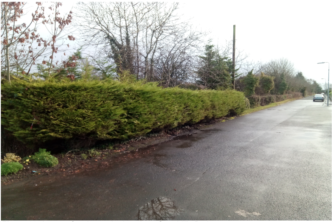
Figure 02: Image of perimeter hedge along Curryhill's Park